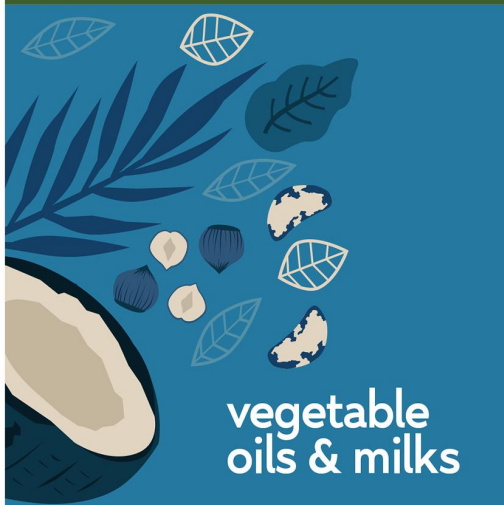
vegetable oils & milks