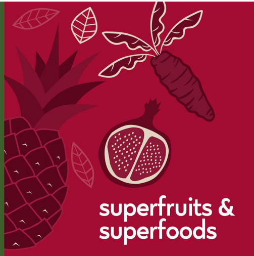
superfruits & superfoods