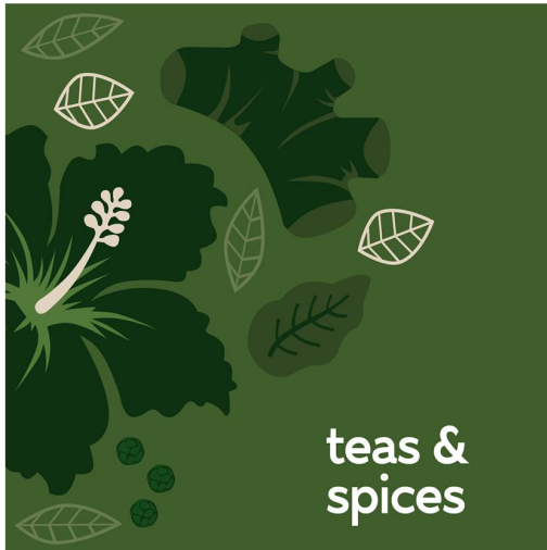
teas & spices